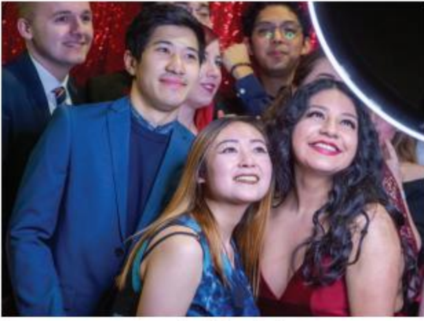
Party-goers pose at the Unity Gala.