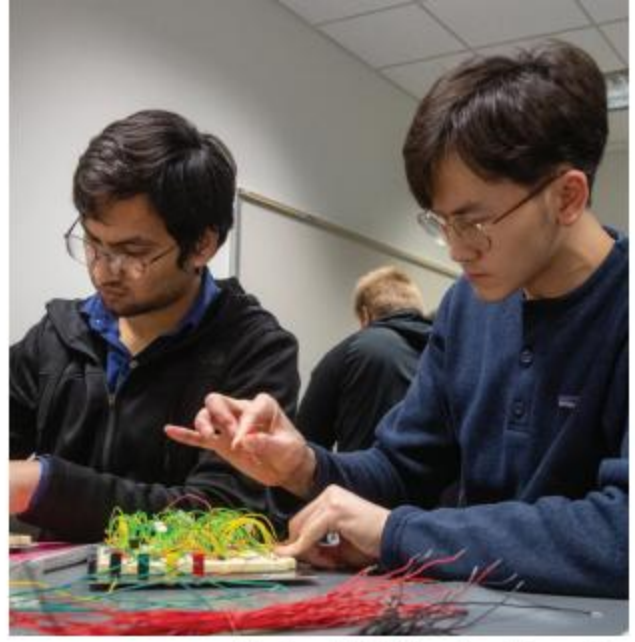
Students build a circuit board in Computer Science class.