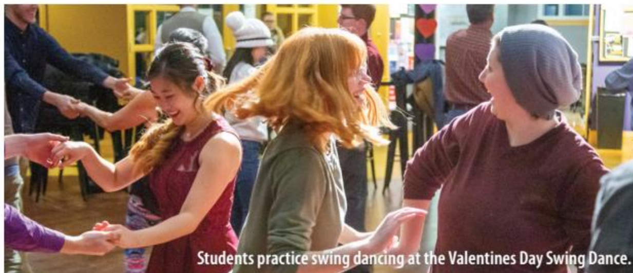
Students practice swing dancing at the Valentines Day Swing Dance.