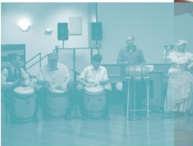
Chicago band AfriCaribe performs the Bomba at Barrio Fiesta.