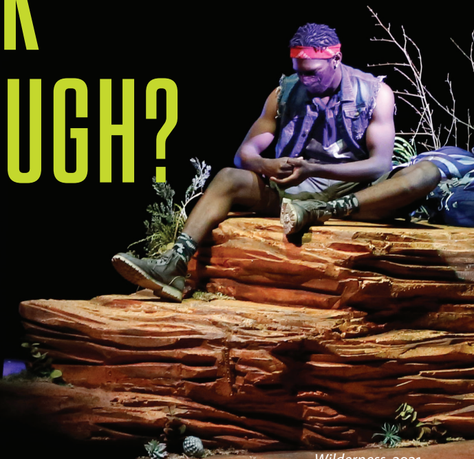
On The Cover: Airline Highway, 2022