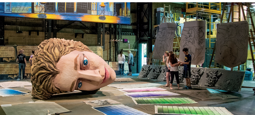
Scene painting class

IWU students are never taught by or asked to compete with graduate students. Our students have more opportunities to write, perform, direct and design than most of our competitors.