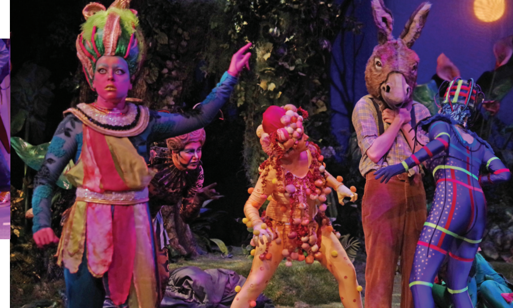
Midsummer's Night Dream, 2019