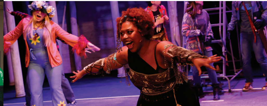
The Lightning Thief, 2022