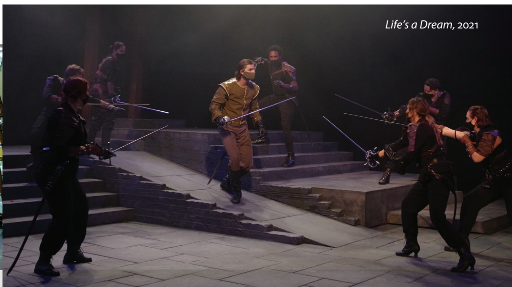
Life's a Dream, 2021

SoTA supports all students, faculty and staff and celebrates their differences through faculty training, contemporary repertoire and inclusive educational practices. We intentionally engage a variety of guest artists to illuminate the diversity of contemporary theatre. We aim to foster a community free from discrimination on the basis of race, gender, culture, age, religion, sexual orientation, socioeconomic background, and myriad other social identities and life experiences.