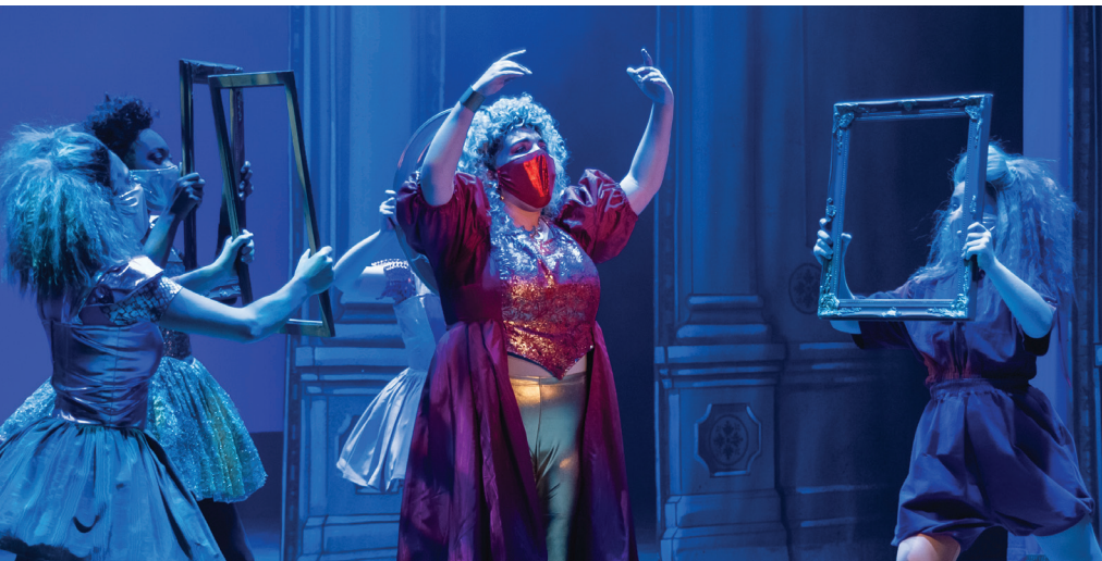
Head Over Heels, 2021